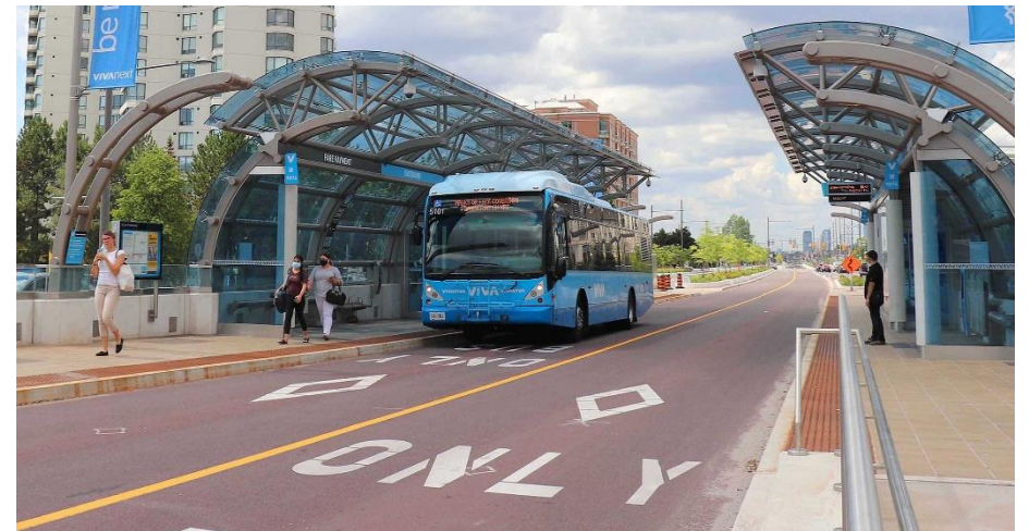
Busway examples: Top – G Line (LA Metro); J Line (LA Metro), Yonge Rapidway (York Region)