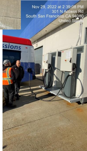
Nov 29, 2022 at 2:39:08 PM 301 N Access Rd South San Francisco CA 94080 United States