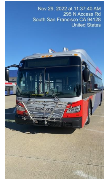
Nov 29, 2022 at 11:37:40 AM 295 N Access Rd South San Francisco CA 94128 United States