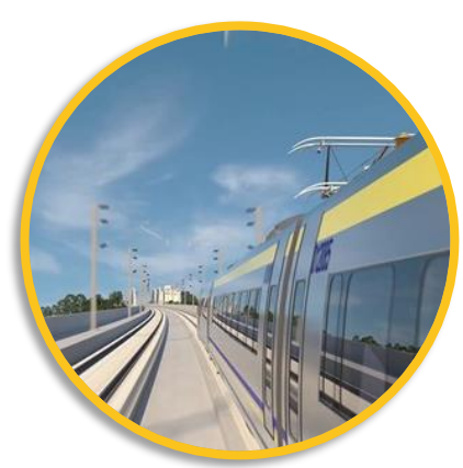
Track & Systems RFP