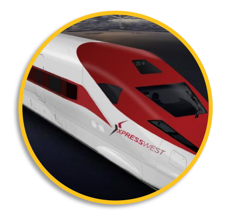
Virgin Trains MOU