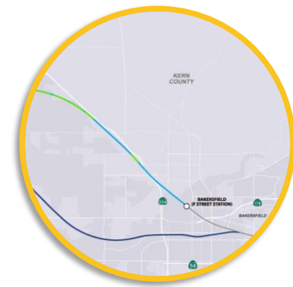
Bakersfield LGA ROD